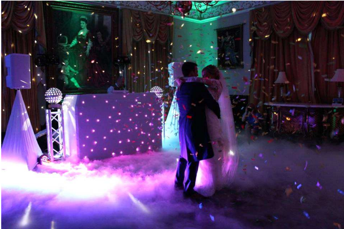
Dry Ice Dancing on Clouds for your first dance (Exclusively free to Craig y Nos clients only who book the sweep package but worth £300)